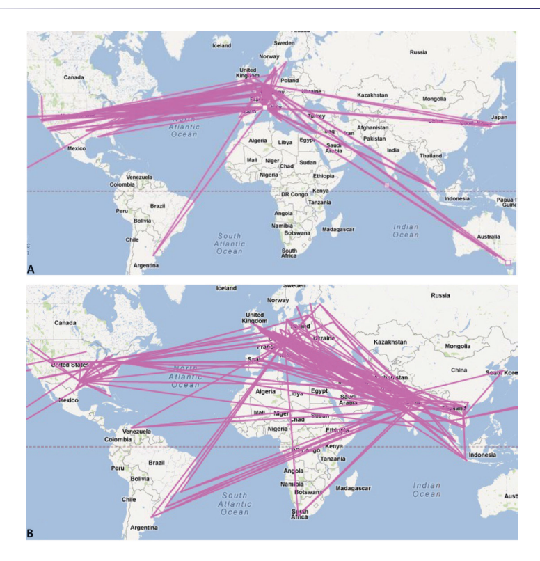
Figure 2. International collaboration patterns of IPIN papers in SCIE regarding the dominant research areas using Google Maps: The geographic maps belong to Biochemistry and Molecular Biology, and Microbiology, accordingly.

activities of their members as well as doing research.