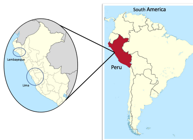
Figure 2. Location of CMHCs Included in the Study. Abbreviation: CMHCs, community mental health centers.

The CMHCs have between 14 and 20 employees each. Staff members are clinicians, including psychiatrists, primary care physicians, psychologists, nurses, social workers, occupational and language therapists; and support personnel including technicians, administrative and security staff. Only clinicians