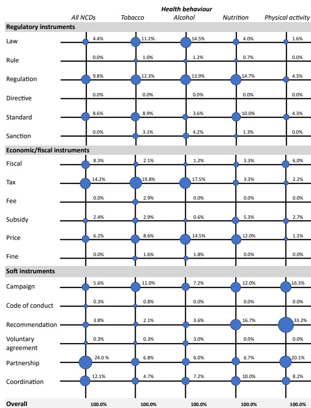
Figure 3. Word Frequency Analysis of Policy Instruments, Indicating the Share of Individual Policy Instruments for Each Health Behaviour (in percent). Abbreviation: NCDs, non-communicable diseases.

licensing of retailers. In alcohol prevention, restrictions on alcohol sales, regulations on the marketing of alcoholic products and regulations on drink-driving, licensing, labelling and packaging were mentioned more than once. The term most often appeared in the context of “self-regulation” of the alcohol industry – however, following the analytical framework, we did not code this as a regulatory but as a soft policy instrument. In nutrition, regulations are most relevant in the context of food quality, content and safety control. Other regulations often focus on one specific topic, such as the marketing of breast-milk substitutes, the marketing of foods and beverages to children or infant-feeding products. In the physical activity sector, regulations that deal with urban design or school, workplace, transport-related and leisure-time environments are recommended in a few documents (eg, regarding the reassignment of urban space from private motorized transport to active transport).