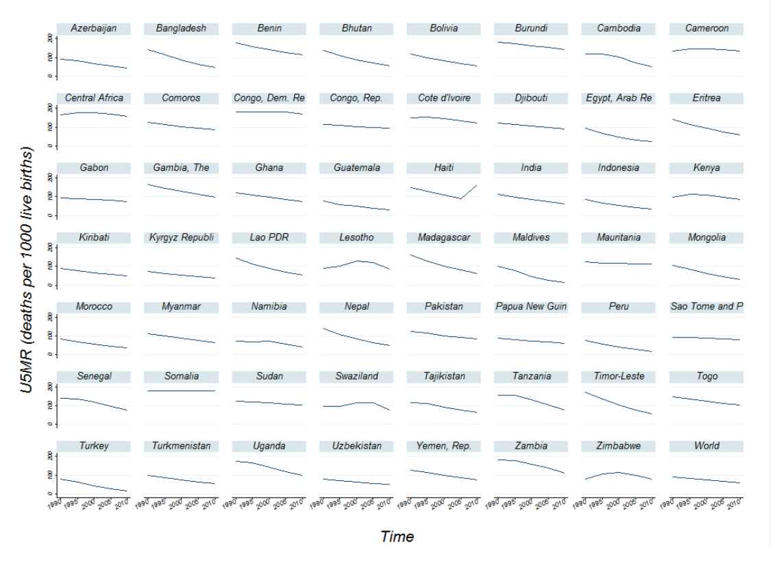
Figure 1. Country-Specific Trends of U5MR Over a 20-Year Period From 1990 to 2010. Abbreviation: U5MR, under-five mortality rate.