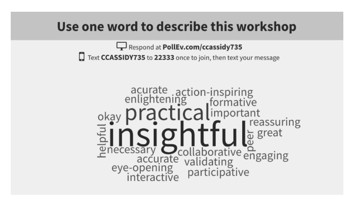
Figure 2. One-Word Evaluation of the Workshop.

This workshop was designed as an initial step to better prepare researchers to work effectively in research partnerships with the health system. Formal evaluation activities, combined