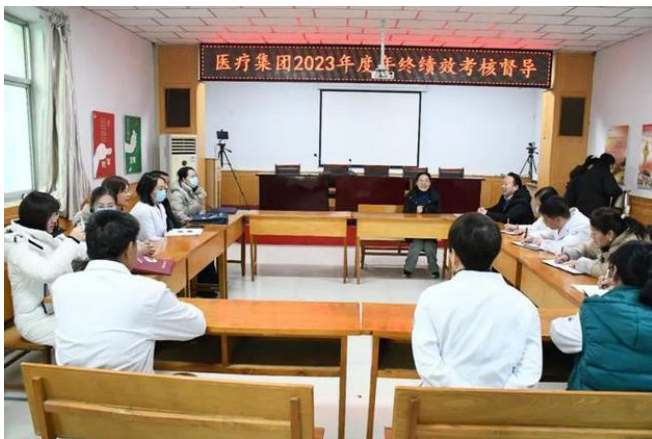
Figure 1. A Rural Township Health Center Performance Appraisal Meeting in Ruicheng County, Shanxi Province, China. The board reads: "The Medical group's performance appraisal evaluation for 2023". Source link.

Overseas, quality measurement programs in other countries were developed for different reasons than in China. In Saudi Arabia, an Interactive Diabetes Registry was established to address the diabetes epidemic by improving data for prevention, disease management, and research. 10 In Israel, the Quality Indicators in Community Healthcare (QICH) program was developed to evaluate the treatment level relative to national and international indicators. 11 In addition, some countries such as Sweden have emphasized the perspective