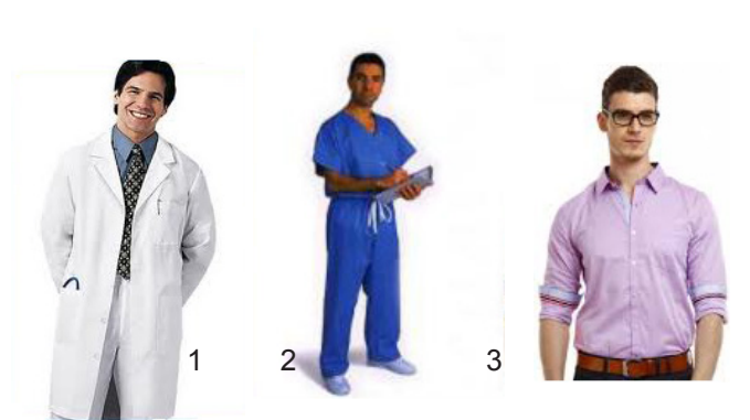
Figure 1. Different surgical attire shown to survey participants