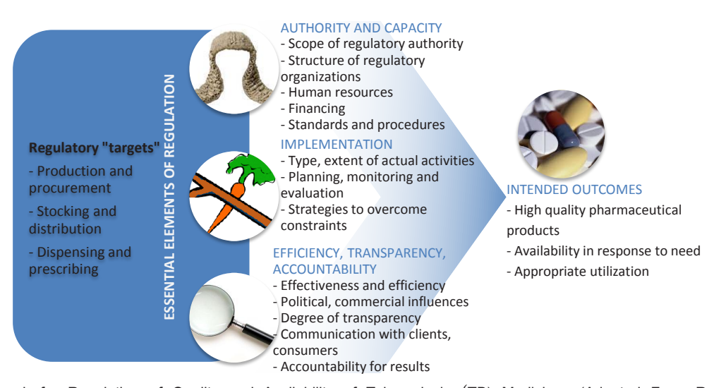
Figure 1. Framework for Regulation of Quality and Availability of Tuberculosis (TB) Medicines (Adapted From Ratanawijitrasin and Wondemagegnehu1).

We drew on data from case studies on the regulation of TB medicines in India, Tanzania, and Zambia commissioned by the WHO, and conducted by a team of researchers led by the lead author in the period from 2009-2011. 12,13 These