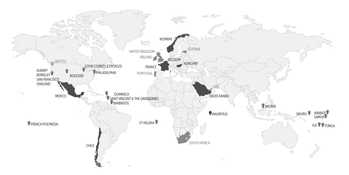
Figure 1. Jurisdictions With Existing (Dark Grey) and Forthcoming (Light Grey) SSB Taxes.

Note: This figure was prepared using data from the NOURISHING database, academic references and market reports. Given the rapid development of policies and involvement of multiple levels of government, it may not include all jurisdictions with health-related SSB taxes. Abbreviation: SSB, sugar-sweetened beverage.