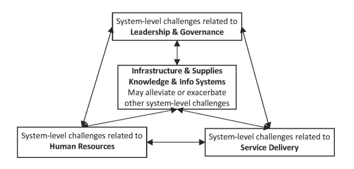
Figure 1. Analytical Framework.

Although van Olmen et al<sup>25</sup> do not explicitly recognize this point, innovations may affect more than one health system component simultaneously, as illustrated by the dotted arrows in Figure 1. For instance, innovations transform service delivery by providing patients and service providers with new means to screen, diagnose and treat diseases, thereby putting pressure on human resources since their proper use may require new sets of expertise and skills.<sup>26,27</sup> While certain innovations may contribute to alleviate system-level challenges, such as telehomecare applications that reduce unnecessary emergency visits,28 the growing complexity of other innovations may exacerbate existing challenges. For instance, though genomics technologies have been developed at a rapid pace and some at a lesser cost, their proper integration within health systems requires a host of auxiliary adaptations in terms of infrastructures, staff training, clinical guidelines, patient decision aids, etc. For Lucassen and