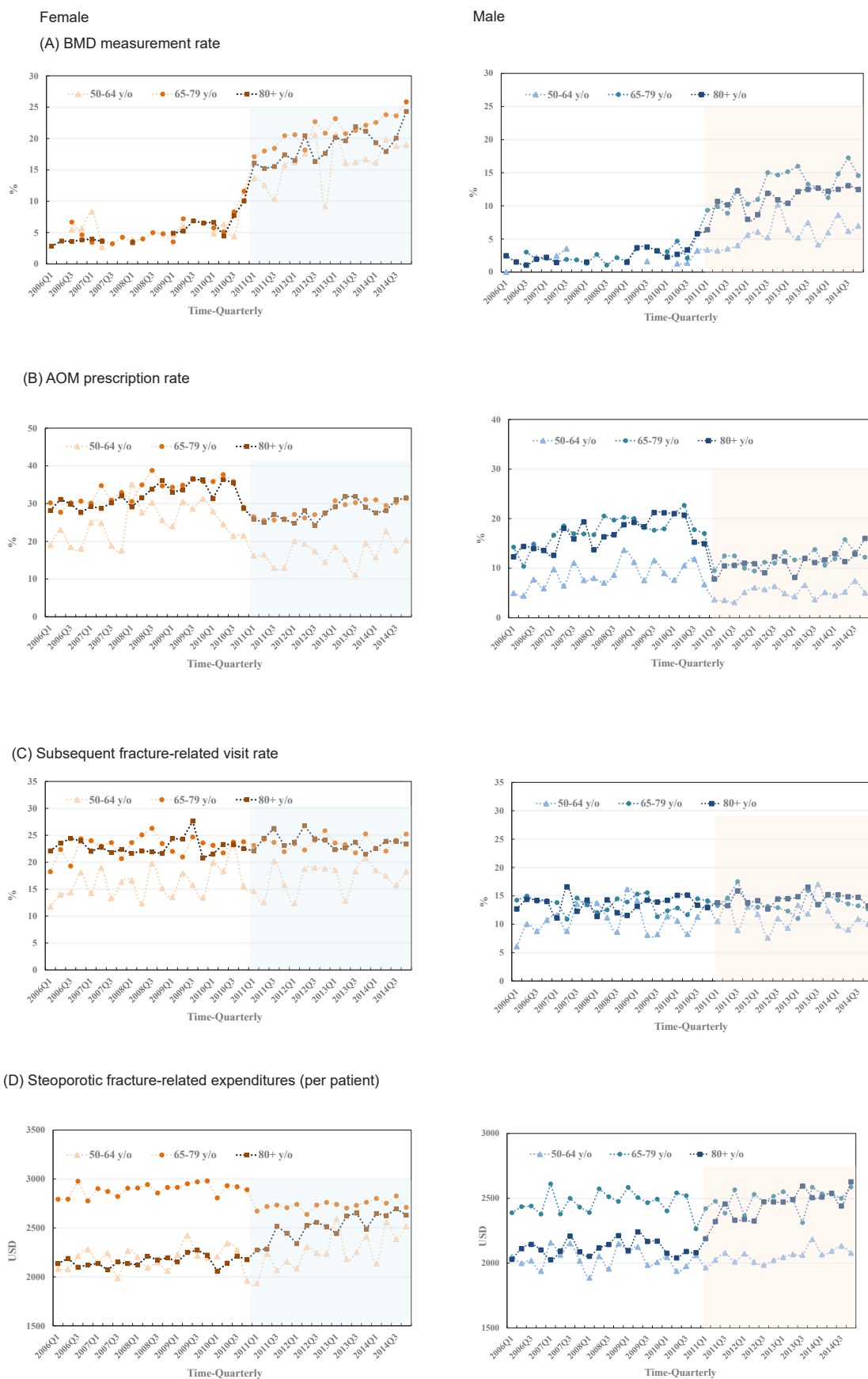
Figure 2. Changes in National Health Insurance Reimbursement Criteria on (A) BMD measurement within 3 months post index hip fracture, (B) AOM prescription rate within 1 year post index hip fracture, (C) Subsequent osteoporotic fracture-related visit within 3 years post index hip fracture, and (D) Osteoporotic fracture-related healthcare expenditures within 3 years post index hip fracture per patient. Shadow means the period post reimbursement criteria change since January 2011. Abbreviations: BMD, bone mineral density; AOMs: anti-osteoporosis medications.