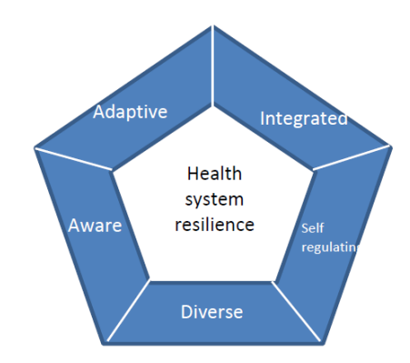
Figure 1. A Priori Framework for Health System Resilience. Source: Figure modified from Kruk and colleagues' framework.<sup>11</sup>

As reiterated by various authors, 10,15-17 the Ebola crisis in 2014 had been the defining moment upon which the concept of health system resilience, or the lack thereof, was brought to the domain of the health sector, and the international community has formed a consensus around the importance of building a foundation of resilient health systems. Therefore, only literature since the Ebola crisis in West Africa has been considered in our analysis. This review has also not included COVID-19 related studies as the search and analysis have been conducted before the occurrence of the pandemic. The findings and implications of this study, however, remain highly relevant, as low- and middle-income countries will