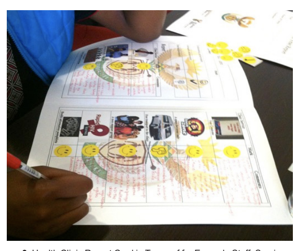
Figure 3. Health Clinic Report Card in Terms of for Example Staff, Services and Availability of Treatment.