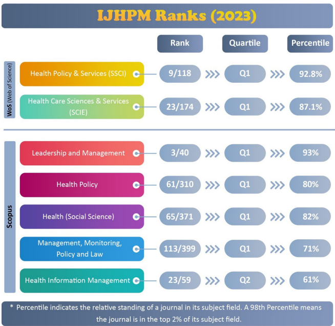
Figure 2. International Journal of Health Policy and Management Ranks Based on Clarivate Web of Science and Scopus.

IJHPM remains committed to advancing health policy and management research throughout 2025. With continued collaboration from our authors, reviewers, and editorial board, we aim to strengthen our impact, uphold the highest academic standards, and foster a more inclusive global research community.