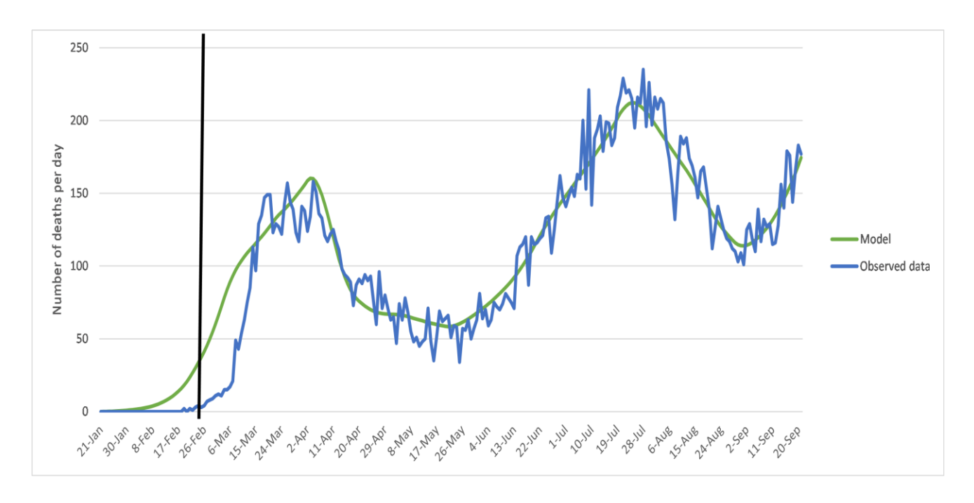
Figure S2. The calibrated model output based on the death toll in Iran. (The vertical black line is the date when the NPIs were started in Iran).